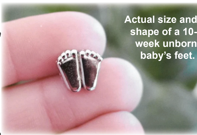
Actual size and shape of a 10-week unborn baby's feet.

"Of course you can't even consider having your baby. Your reputation, your hopes, your dreams, your goals, your whole future will all be ruined if you carry to term. Imagine the suffering of the poor child! It's not fair to bring a baby into the world at your age -- you're still a child yourself. Imagine your baby's shame. The best thing you can do, the only thing you can do, is terminate your pregnancy."